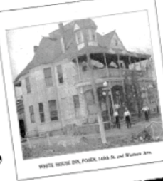
WHITE HOUSE INN, POSEN, ILL. (No. 1408 So. Dearborn Ave.)